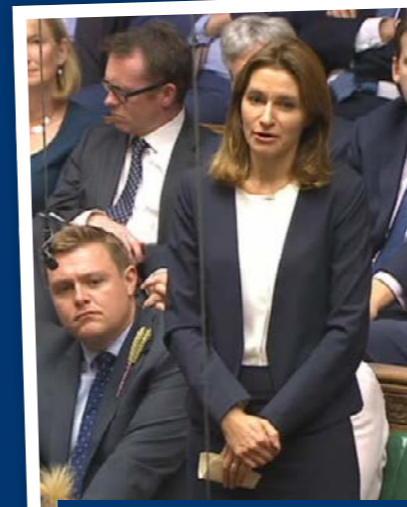
Standing up for you in Parliament

■ Of course, Brexit continues to dominate our national debate. This leaflet sets out what I have been working on locally, for you, since I was first elected. In parliament I have consistently voted to honour the result of the referendum and to do so in an orderly manner providing certainty for our future and securing the best possible trading relationship with the EU going forward.