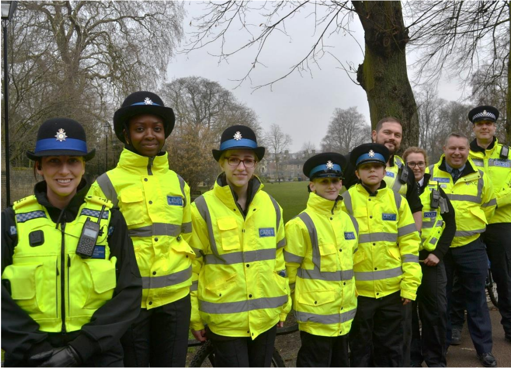
The Commissioner meeting Volunteer Police Cadets and Police Officers on Crime Prevention Day